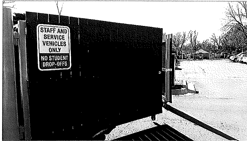
Photo of the current sign at the entrance of the staff parking lot on Pierce St NE at 17 th Ave NE

As a result of this review, the following updated recommendations have been developed: