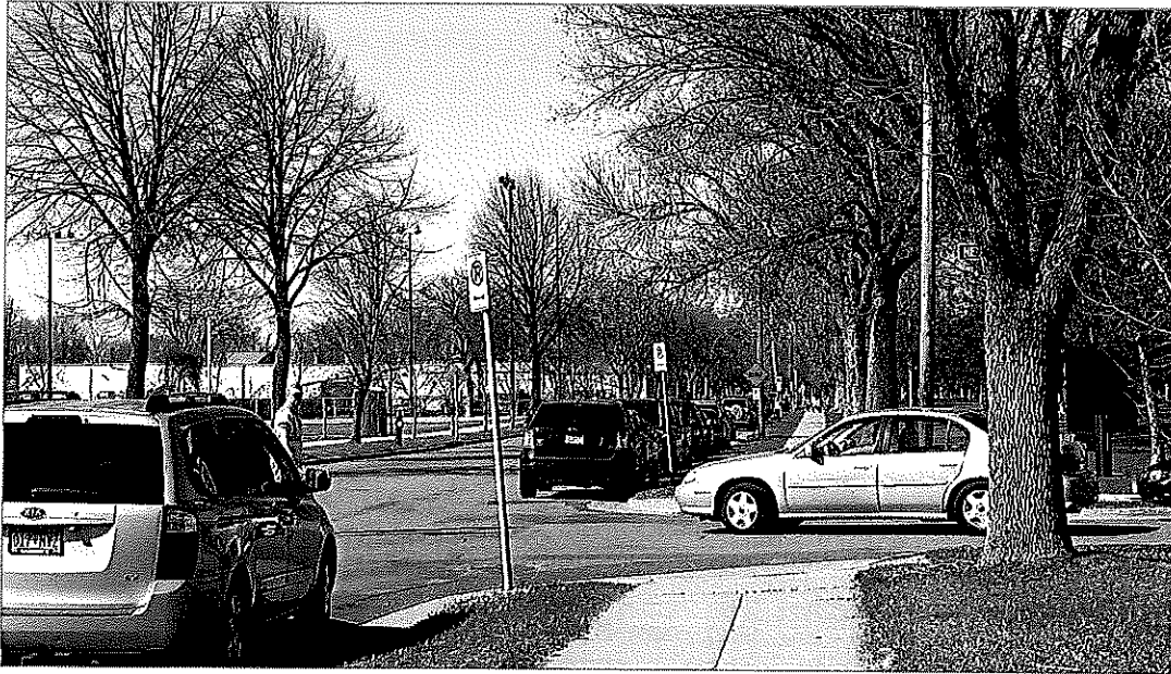
Photo of staff member directing traffic and managing the queue at the intersection of Fillmore St NE/14 th Ave NE