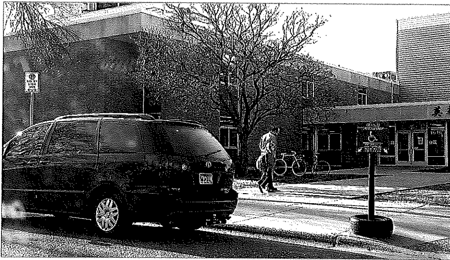
Photo of vehicle temporarily stopped in the designated disabled parking zone.